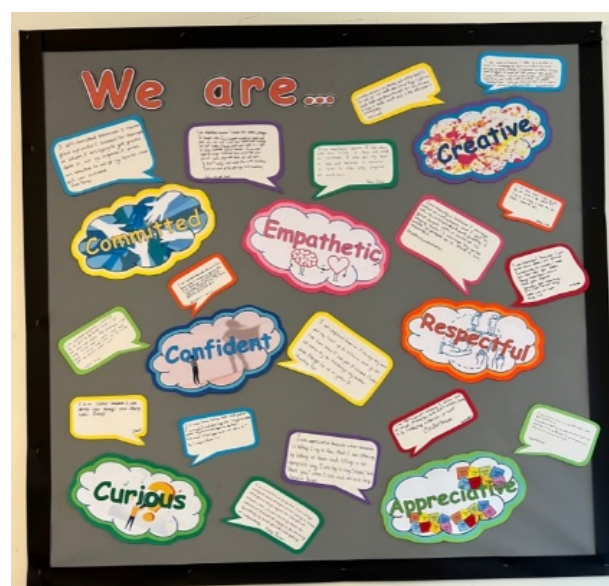
Our school visions & values display, by Year 6.